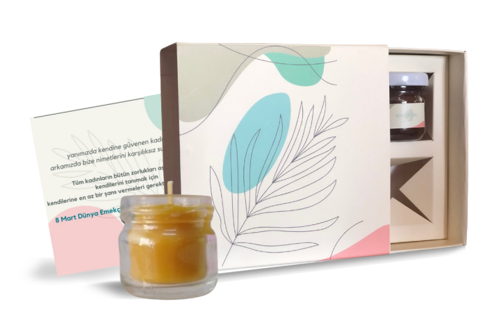
Wax Candle Set

We started with wax candles! We received our trainings and prepared a wax set in mini jars of 4 for you.