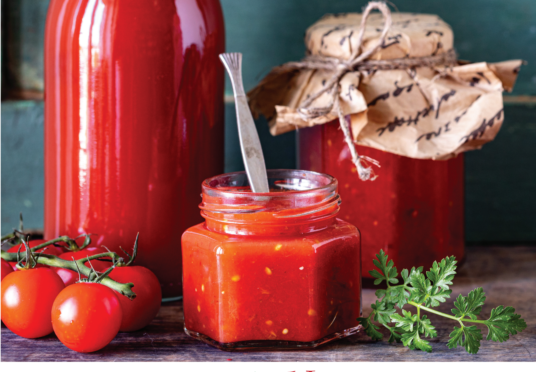
Mer mevsim yemelik"