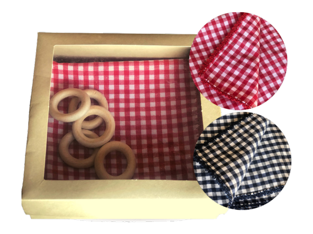
Fabric Napkin 6 pcs with Embroidered Edge – Red or Blue